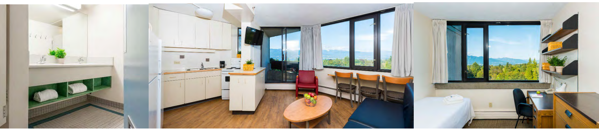
If capacity in the apartments and semi-private units are exceeded, students will be placed in traditional student dormitories